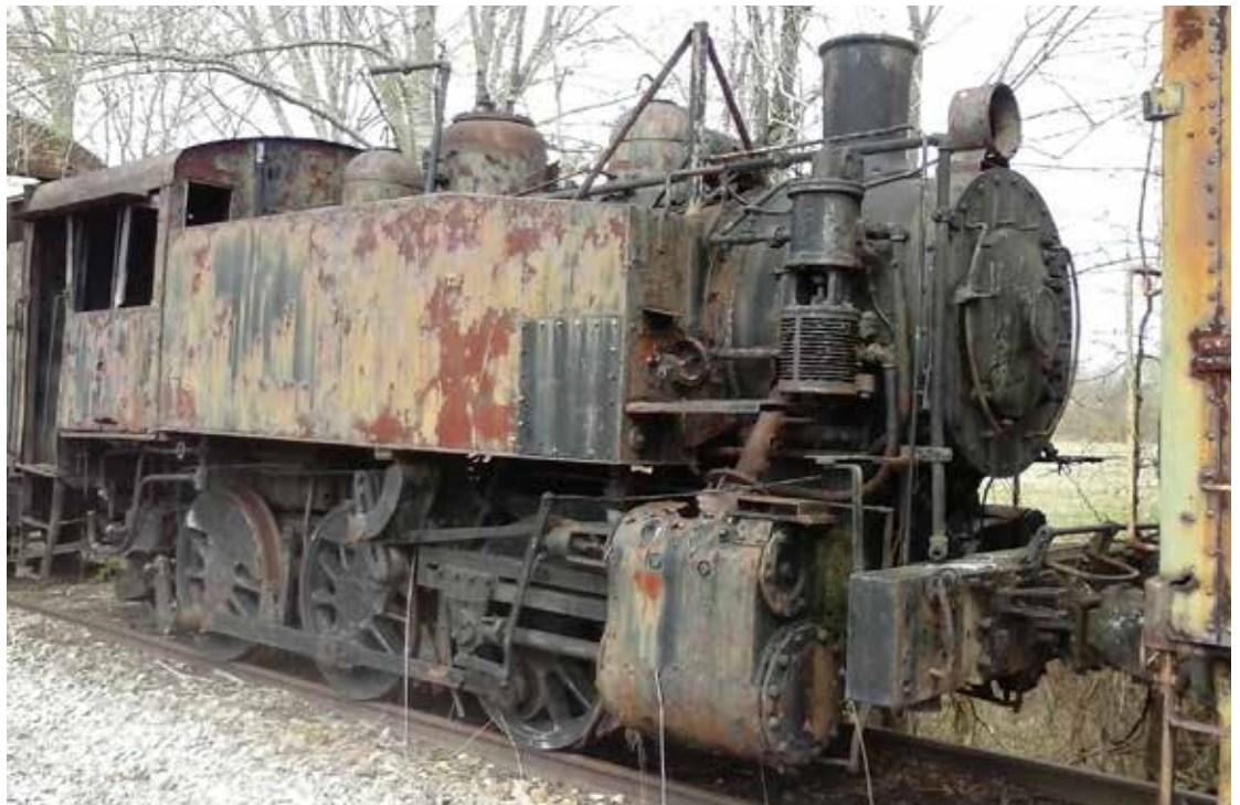
PROJECT 02 BEFORE TRIP TO NEW HOME – The Porter 0-6-0 steam engine is shown at its former home in Kentucky in April.