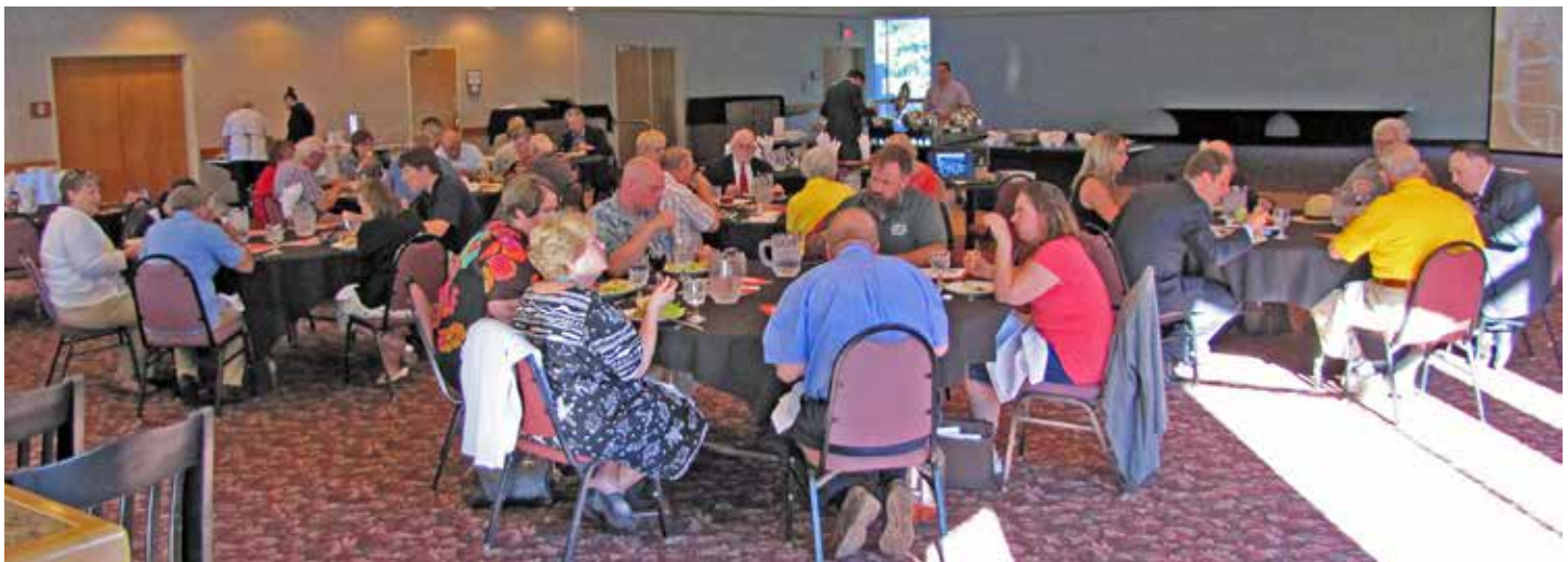
AT ANNIVERSARY CELEBRATION – Members of the Central New York Chapter NRHS celebrated the organization’s 75th anniversary with a banquet.