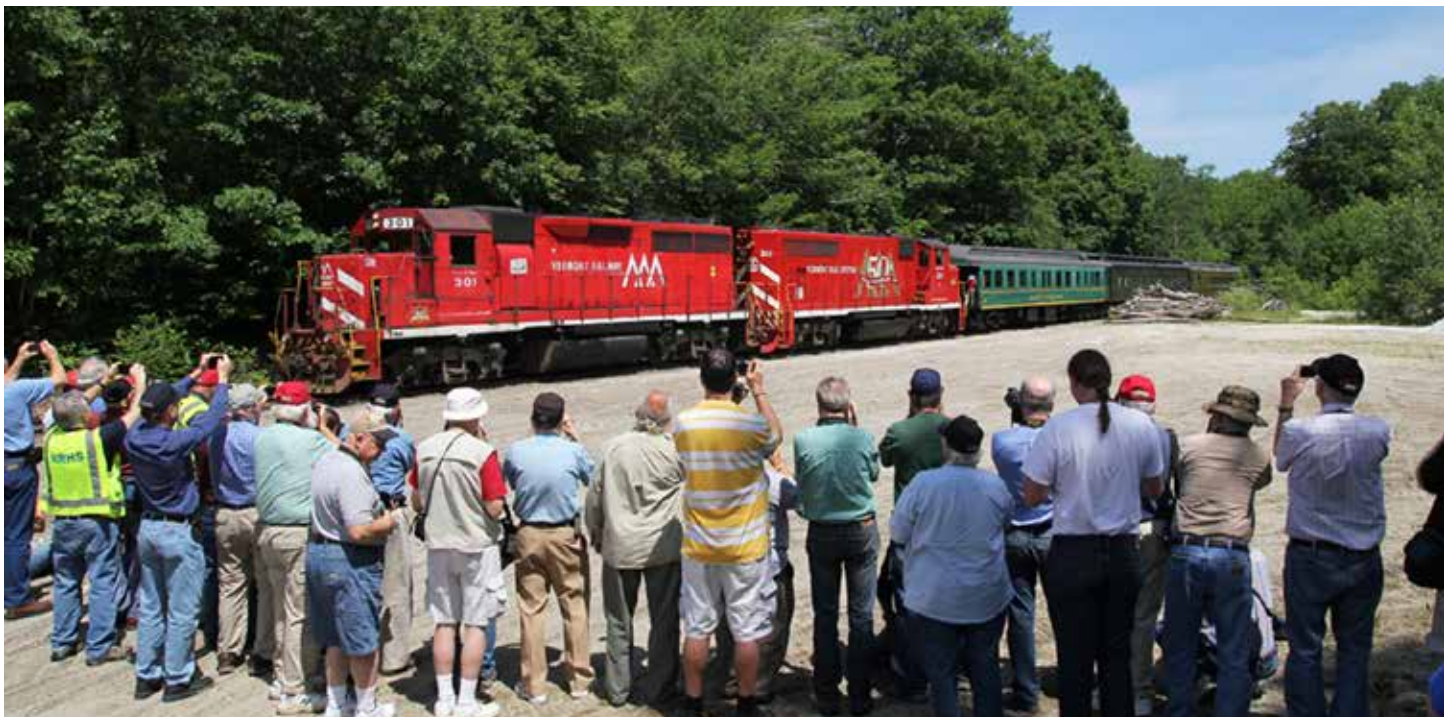
PHOTO LINE – Cameras stayed busy among the members of the photo line during another “rare mileage” excursion on Saturday, June 20, between Rutland and Hoosick Junction, N.Y., on the freight-only Vermont Railway line of the Vermont Rail System (VRS). The 12-car train was powered by VRS GP40 No. 301 and VRS GP40-2LW No. 311, painted in a red, white and gold 50th anniversary paint scheme. The first of two runbys was held in a gravel pit at milepost 40, en route to Hoosick Junction.