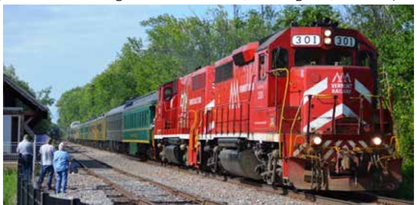
THURSDAY TRIP — The “main event” on Thursday was a 140-mile round trip from Rutland to Burlington, Vt. on the VRS line. In this photo, the train passes the station at Charlotte, Vt.