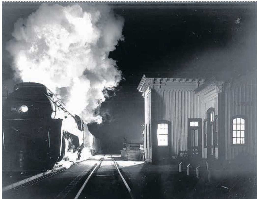
ICONIC PHOTO — O. Winston Link's iconic photo of Norfolk & Western steam engine was made on Christmas Eve 1957.