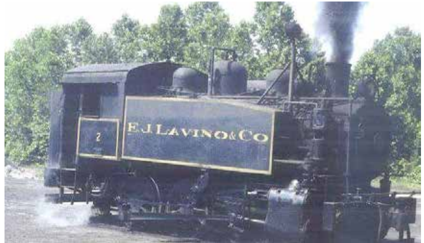
PROJECT 02 UNDER STEAM – The S-100 class engine is shown in operation in 1952, 10 years after it was constructed.