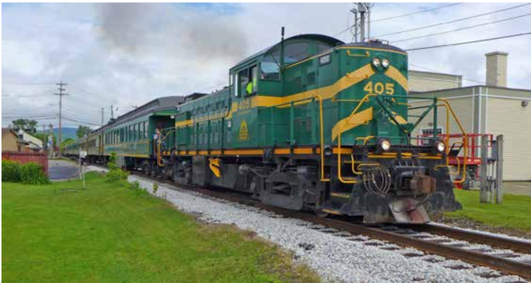
FINAL EVENT — The "Father's Day Special" trip from Rutland to Ludlow was the final event of the convention. Motive power for the trip was provided by former Rutland locomotive No. 405, and ALCO RS-1 built in 1951.