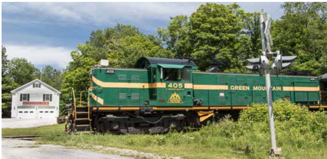
VERMONT COUNTRYSIDE – The mixed photo freight on the opening day of the convention, powered by ALCO RS-1 No. 405, rolls through Shrewsbury, Vt.