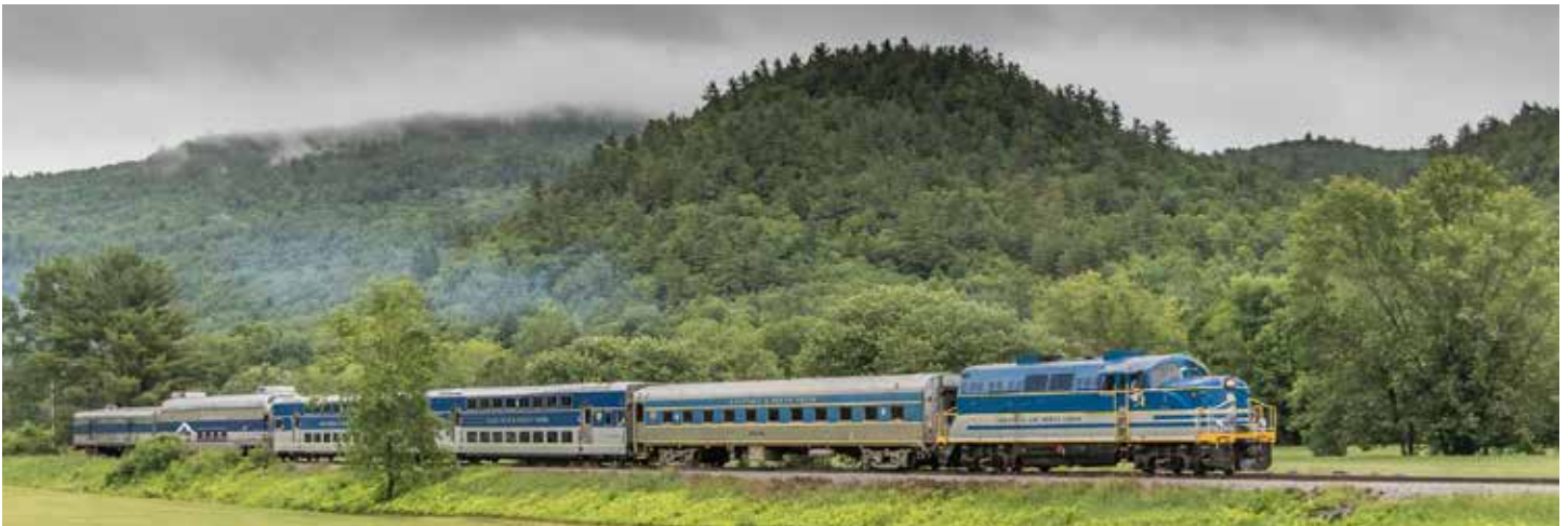
AT STONEY CREEK – The southbound Saratoga & North Creek excursion passes the 1,000 Acres Golf Course at Stoney Creek, N.Y.

vided an overview of the five railroads which comprise today's VRS. He also described the services the VRS provides and commodities carried. He concluded his presentation with images and narrative about the major damage that Hurricane Irene inflicted on the VRS in 2011.