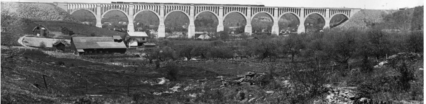
SOON AFTER COMPLETION – This photo, from the archives of the Steamtown National Historic Site, shows the Nicholson Bridge soon after it was put into service.