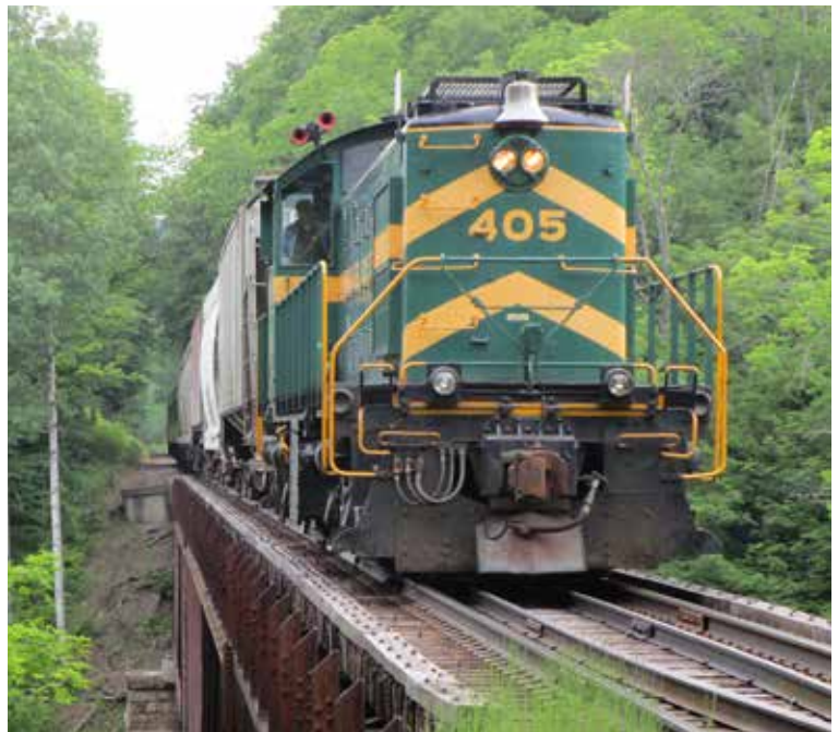
PHOTO FREIGHT — Former Green Mountain ALCO RS1 No. 405 pulled a mixed photo freight on the first day of the convention.

Following Zullig’s comments, Carl Jensen provided an update about the RailCamp program and thanked the NRHS chapters that assisted with this program. Baskets were then passed among the attendees for donations to the RailCamp program. A total of $2,057 was collected, which set a record for NRHS banquet donations. An anonymous NRHS member agreed beforehand to match the amount collected, dollar for dollar.