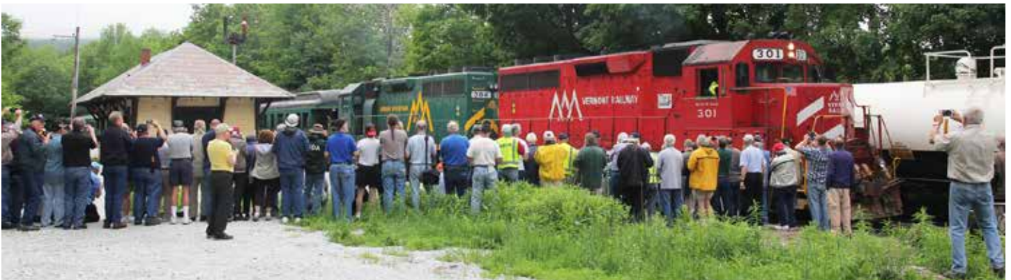
PHOTO LINE – Photographers gathered for a runby at the former Rutland station at Ludlow, Vt. during the round trip excursion between Rutland and Bellows Falls, Vt. on June 16. The trip ran over the former Green Mountain Railroad, an all-freight line now part of the Vermont Rail System.

(Editor's note: A large number of photos from the convention were submitted for publication. There wasn't enough room for all of them, but we will include them in future editions as space permits).